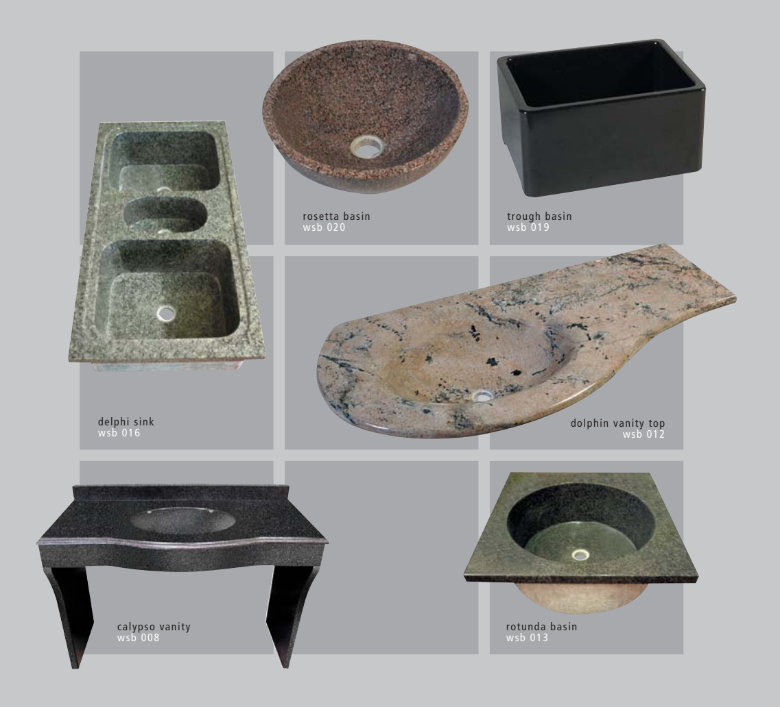
unique hand-crafted designer basins